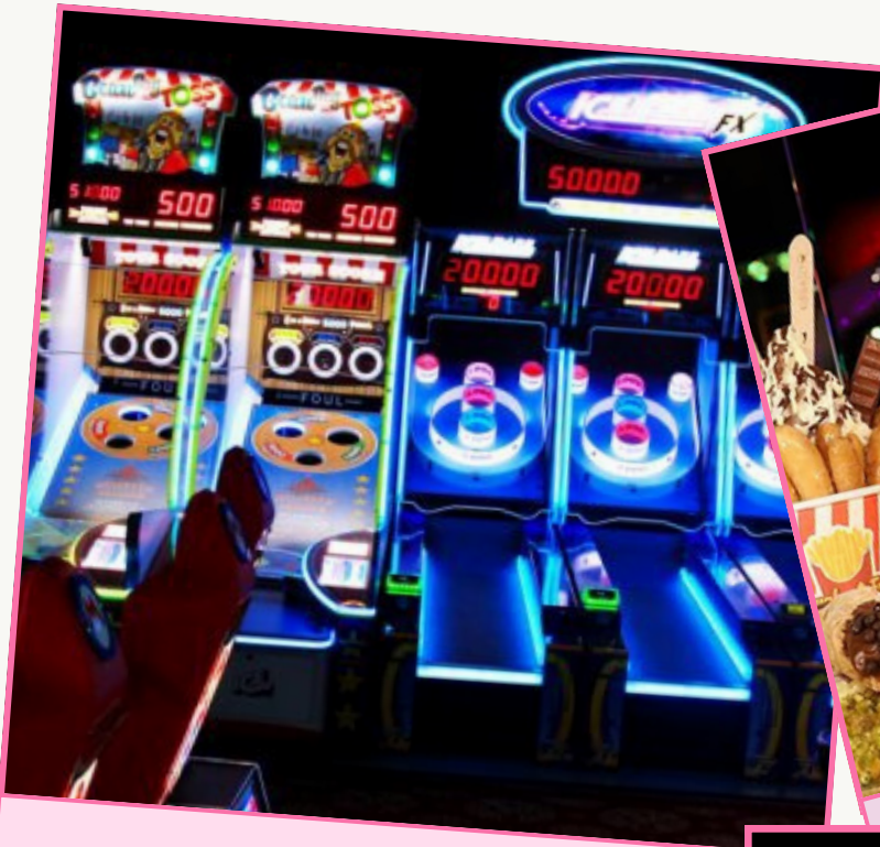
B. Lucky & Sons

1. B.Lucky & Sons is the ultimate hangout spot - blending arcade fun, cool drinks, and tasty bites right in the heart of the city. It's the perfect spot for an exam wind-down with your classmates!