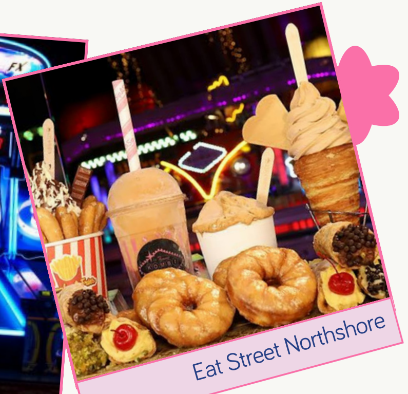
Eat Street Northshore

3. Located just outside the Fortitude Valley train station is a vibrant nightlife hub buzzing with clubs, bars, and live music venues. It's the go-to spot for a lively night out in Brisbane!