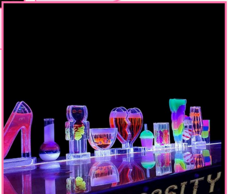
Brunswick Street Mall